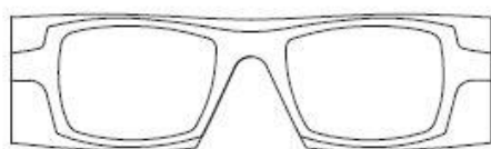
Grace (Kelly - °USA) 1929-1982